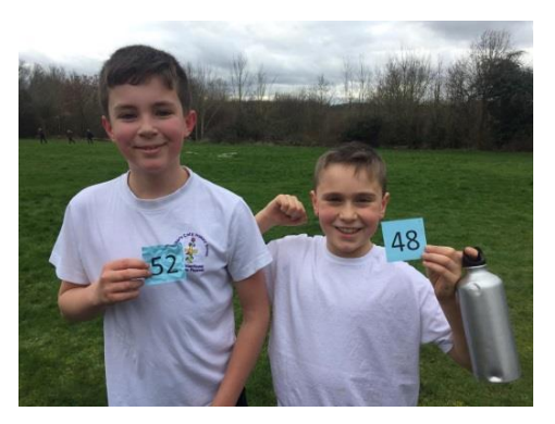
Cross country: Once again the cross country team gave it 100% at this week's event. Well done to them all.