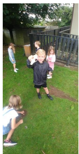
print to investigate when they got outside.