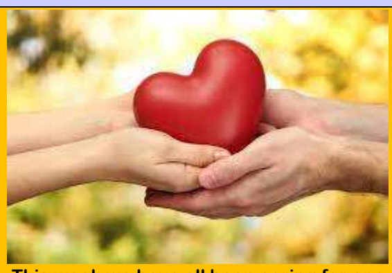
This week we have all been caring for one another!